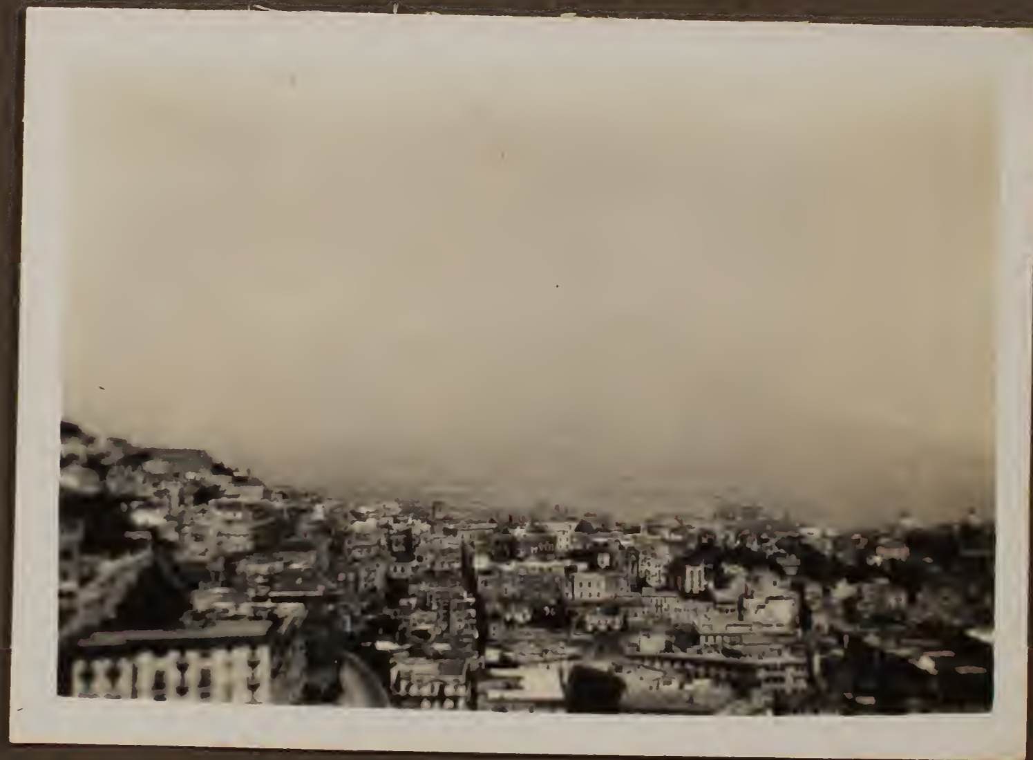
From Prestinari's Hotel